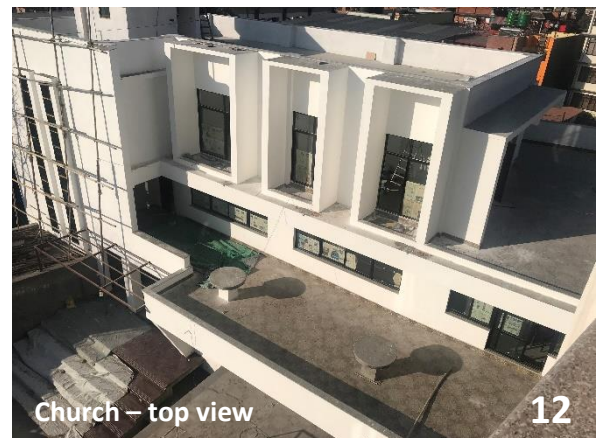
Church – top view