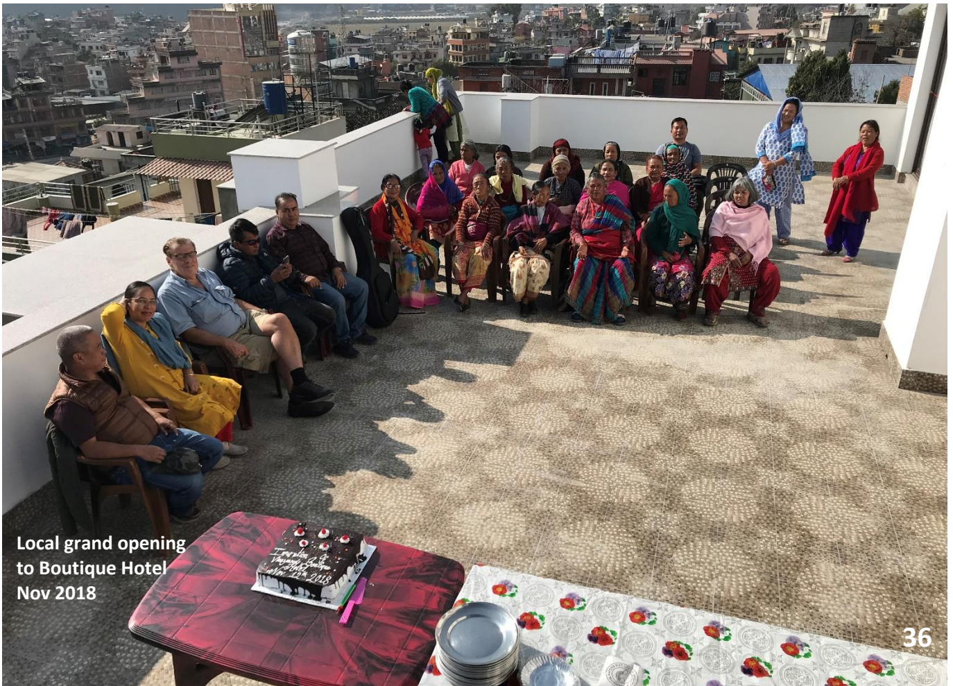
Local grand opening to Boutique Hotel Nov 2018