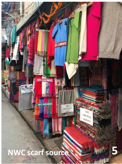
NWC scarf source