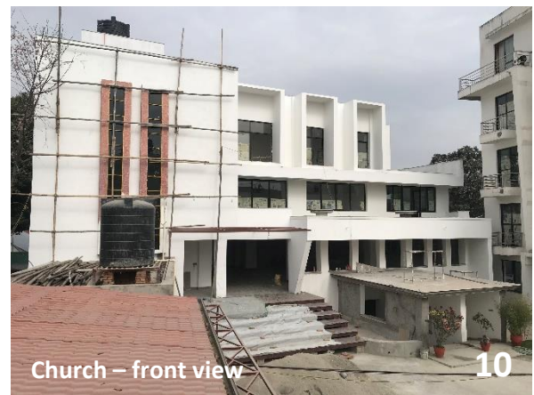
Church – front view