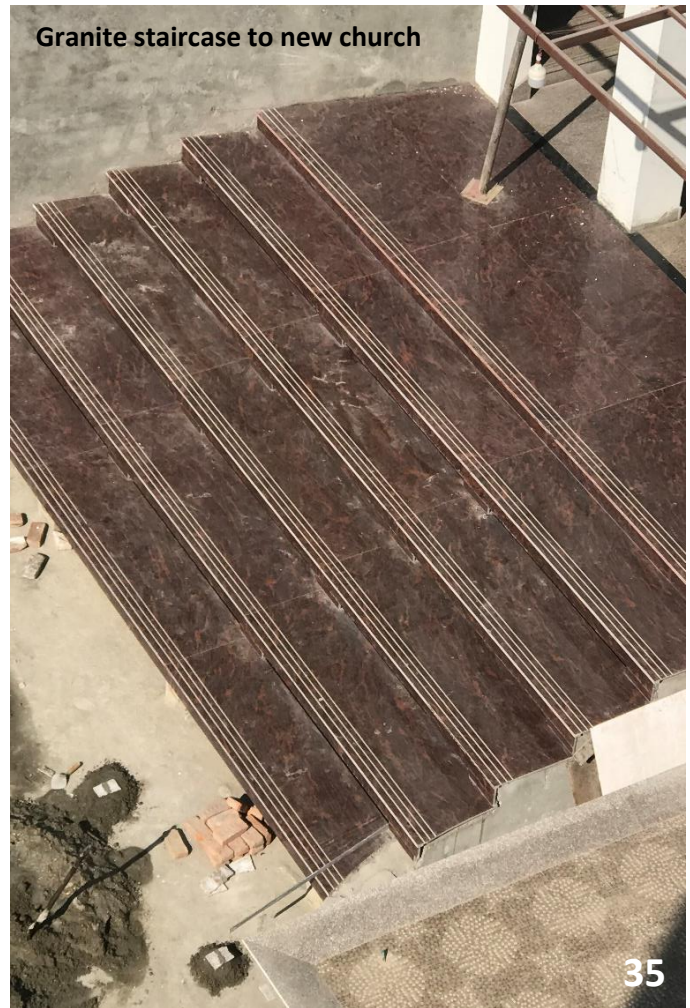
Granite staircase to new church