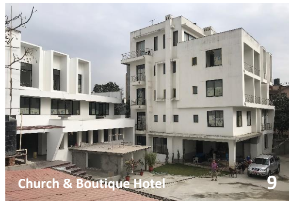
Church & Boutique Hotel