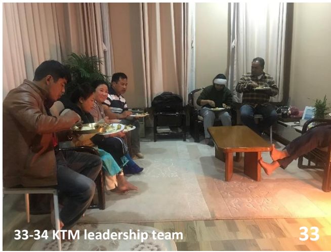
33-34 KTM leadership team