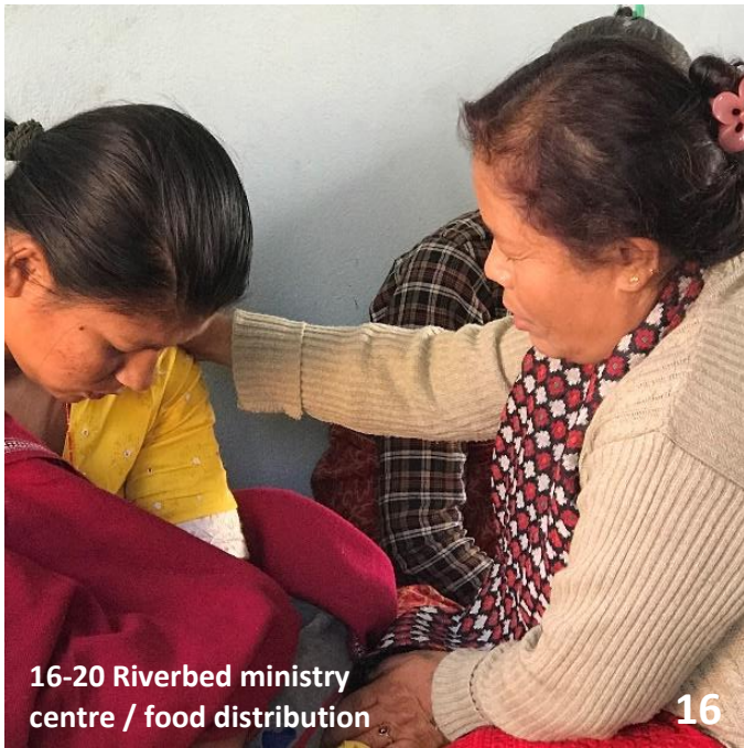
16-20 Riverbed ministry centre / food distribution