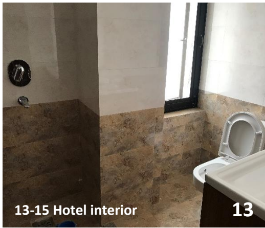
13-15 Hotel interior