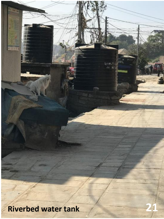
Riverbed water tank