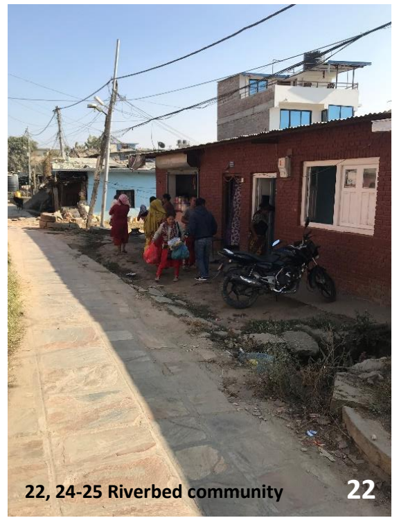
22, 24-25 Riverbed community