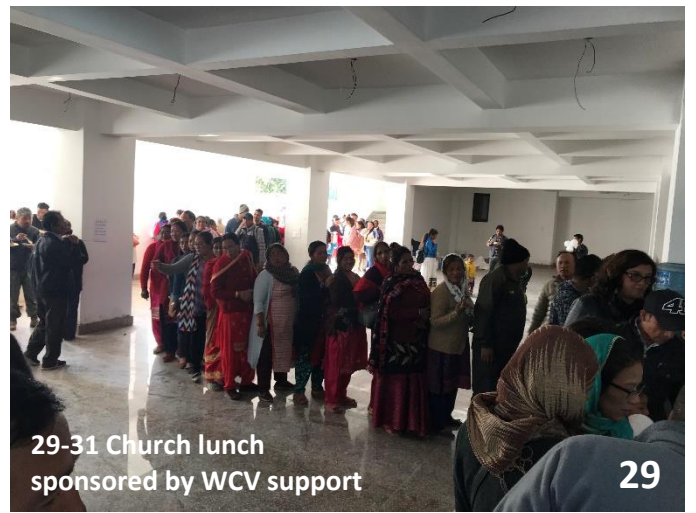
29-31 Church lunch sponsored by WCV support